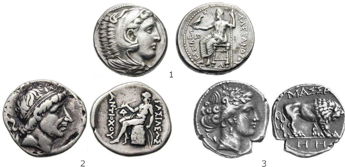
Fig. 2. - No.1: Alexander III 'the Great' (336-323 BC), silver tetradrachm (17,03 g, 26 mm), posthumous issue of Amphipolis (Macedonia), ca. 318-317 B.C. Obv.: head of Herakles right wearing lion's scalp. Rev.: Zeus enthroned left holding scepter and eagle; numerical notations in left field; ΒΑΣΙΛΕΩΣ ΑΛΕΞΑΝΔΡΟΥ, "(coin) of the King Alexander" (Classical Numismatic Group, Auction no.25, London March 2005, lot no.61986).

No.2: Antiochos I (281-261 BC), silver drachm (4,13 g, 20 mm) minted at Seleucia on the Tigris. Obv.: Diademed head of Antiochos I right. Rev.: Apollo seated left on omphalos, examining arrow and resting hand on grounded bow, numerical notation in left field; ΒΑΣΙΛΕΩΣ ΑΝΤΙΟΧΟΥ, "(coin) of the King Antiochus" (Classical Numismatic Group, Auction no.35, London 13 August 2001, lot no.63743).