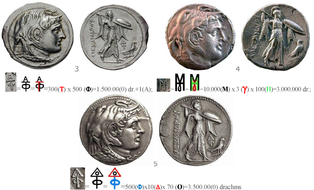
Fig. 7 - The issue of silver tetradrachms struck in 312-309 BC by Ptolemy I Soter, as satrap of Alexander the Great, bearing the image of Athena Promachos and the symbol of the eagle on thunderbolt. Obv.: Head of Alexander right, wearing diadem and elephant's skin headdress. Rev.: Athena Promachos advancing right, brandishing spear and holding shield; numerical notations to right; eagle on thunderbolt in right field; ΑΛΕΞΑΝΔΡΟΥ, "(coin) of Alexander". No.1: Gorny & Mosch Giessener Münzhandlung, Auction no.151, Munich 9 October 2006, lot no.256 (15,67 g, 27,5 mm); No.2: Gorny & Mosch Giessener Münzhandlung, Auction no.190, Munich 10 November 2010, lot no.380 (15,63 g, 27 mm); No.3: Classical Numismatic Group, Auction Triton V, London 16 January 2002, lot no.1532 (15,37 g, 26,7 mm); No.4: eBay, Auction 7 July 2000, Item #374290953 (15,63 g, 27 mm); No.5: Sylloge Nummorum Graecorum , Copenhagen (Denmark), 18 var (15,57 g, 26,3 mm).

A very illuminating numerical progression is the one that characterizes some silver tetradrachms struck in 312-309 BC by Ptolemy I Soter, as a Egypt's satrap, bearing on the reverse the image of Athena Promachos and the symbol of an eagle on the thunderbolt, in Fig. 7 . The great variety of initials on the reverses of the tetradrachms of the same emission confirms that they can only be progressive numbers. These initials are too many to be monograms of monetary magistrates or mint's signs: it is impossible that 18 monetary magistrates took part and it is even more ridiculous to suppose that the same mint could be identified with 18 different initials in only one issue 13 . For the same reason they cannot be simple dates: in an annual date, the month could change but the minting year should have been the same on many coins while the initials are all different from each other. Instead, seen like numbers the initials on the coins reveal an interesting numerical sequence.