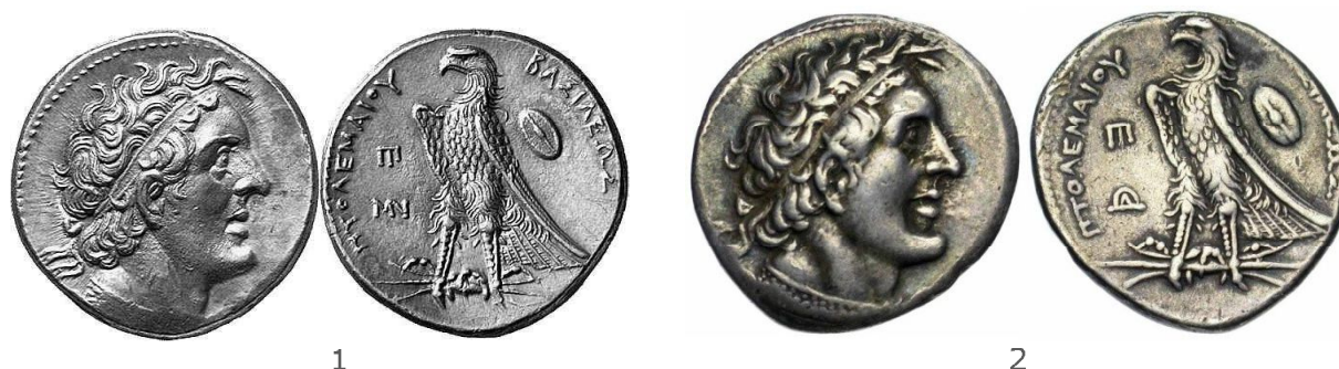
Fig.6 - Silver tetradrchms minted by Ptolemy II Philadelphus in 258-252 BC. in Alessandria. Obv.: Diademed head of Ptolemy I right. Rev: eagle standing left on thunderbolt, with wings closed; shield in right field; ΒΑΣΙΛΕΩΣ ΠΤΟΛΕΜΑΙΟΥ, "(coin) of the King Ptolemy"; numerical notations in the left field. No.1: Leu Numismatik, Auction no.86, Zurich 5 May 2003, lot no.450 (14,22 g, 27,6 mm); No.2: Jean Elsen & ses Fils S.A., Auction no.93, Brussels 15 September 2007, lot no.718 (14,06 g, 27 mm).

die. So MN is equal to 2,000 thousands ( chiliades ) of drachms: the coin with the numerical notation MN belongs to the tranche of issue directed to reach the edition of 500,000 tetradrachms; in fact, if we divide 2,000,000 drachms in 4 (value of one tetradrachm) we get 500,000 that is the number of tetradrachms of corresponding value. The number \Delta , instead, indicates the group of issue of 3,200(,000) drachms corresponding 800,000 tetradrachms (3,200,000 drachms : 4 = 800,000 tetradrachms): only 400,000 drachm are missing (that means 100,000 tetradrachms) and we reach the limit announced of 3,600,000 drachms (this is the number of drachms corresponding to 900,000 tetradrachms indicated with \Gamma ). The product of 800 ( \Omega ) x 4 ( \Delta ) = 3,200, indicated with \Delta , is a quantity expressed in thousands ( chiliades ) and for this reason this number can be written 3,200(,000) that contains the thousands between brackets 12 .