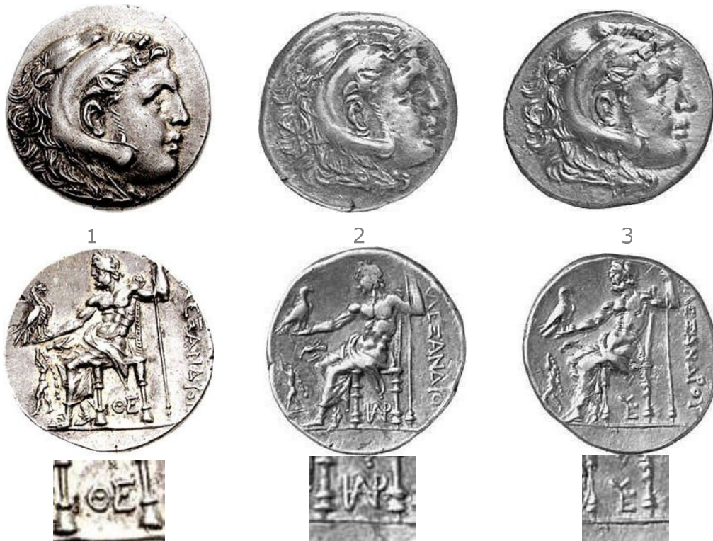
Fig. 8 - Alexander III 'the Great' (336-323 BC), silver tetradrachms, posthumous issue of Sycion (Sycionia), ca. 225-215 BC. Obv.: head of Herakles wearing lion's scalp right. Rev.: Zeus enthroned left holding scepter and eagle; numerical notations under the throne of Zeus; boy left with taenia in left field; on the legs of Zeus dove feeding left; ΒΑΣΙΛΕΩΣ ΑΛΕΞΑΝΔΡΟΥ, "(coin) of the King Alexander".

No.1: Classical Numismatic Group ( www.cngcoins.com ), Mail Bid Sale 69, London 8 June 2005, lot no.163 (17,29 g); No.2: Gorny & Mosch Giessener Münzhandlung, Auction no.118, Munich 15 October 2002, lot no.1264 (16,82 g); No.3: Gorny & Mosch Giessener Münzhandlung, Auction no.118, Munich 15 October 2002, lot no.1265 (16,00 g).