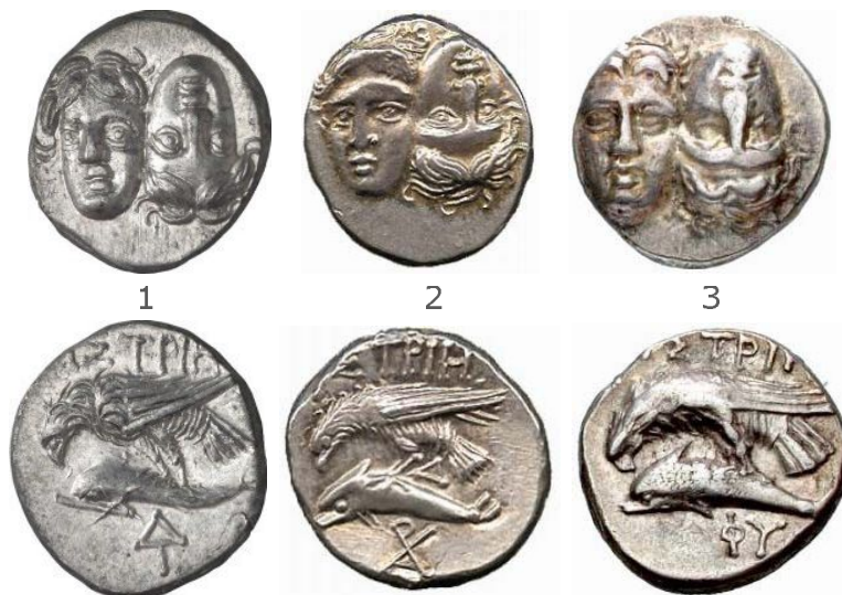
Fig.3 - Silver drachms minted at Istros (Thrace) in the 4th Century BC. Obv.: two young male heads facing side by side, one upright and the other inverted. Rev.: \text{ΙΣΤΡΙΑ} ; a sea-eagle standing to left on a dolphin, attacking it with its beak; numerical notations below. No.1: Classical Numismatic Group, (London) FPL 787292, 2005 (5,60 g, 16 mm); No.2: Baldwin's Auctions Ltd, Auction 47, London 25 September 2006, lot no.24 (5,98 g, 17 mm); No.3: Auktionshaus H. D. Rauch GmbH, Vienna Auction no.11, 12 September 2006, lot no.263 (5,55 g, 15,7 mm).

3 are not letters, but two numbers ( \Phi = 500 and Y = 400 ) that are multiplied together: 500 \times 400 is equal to 200,000, whereby it is obtained that the drachm no. 3 belongs to the group of issue that is directed to reach 200,000 coins minted, that are 200,000 drachms. Evidently engraving on every reverse die the number of coins (that, with the help of the reverse die itself, would be coined), helped the mint workers to count more easily the pieces coined, because it was possible to divide them in groups, each characterized with a different numerical notation.